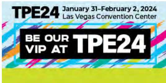
Email Signature without customization